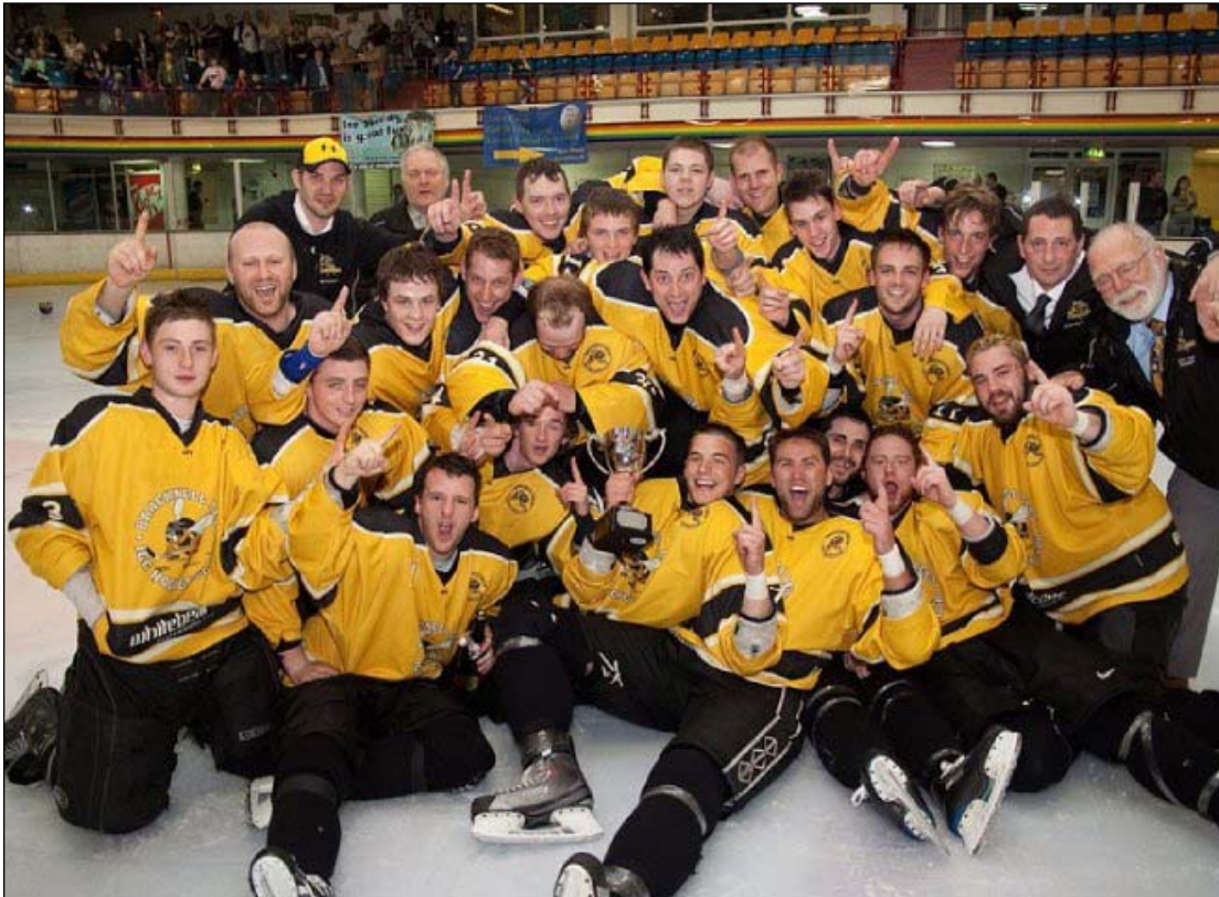
The victorious team.